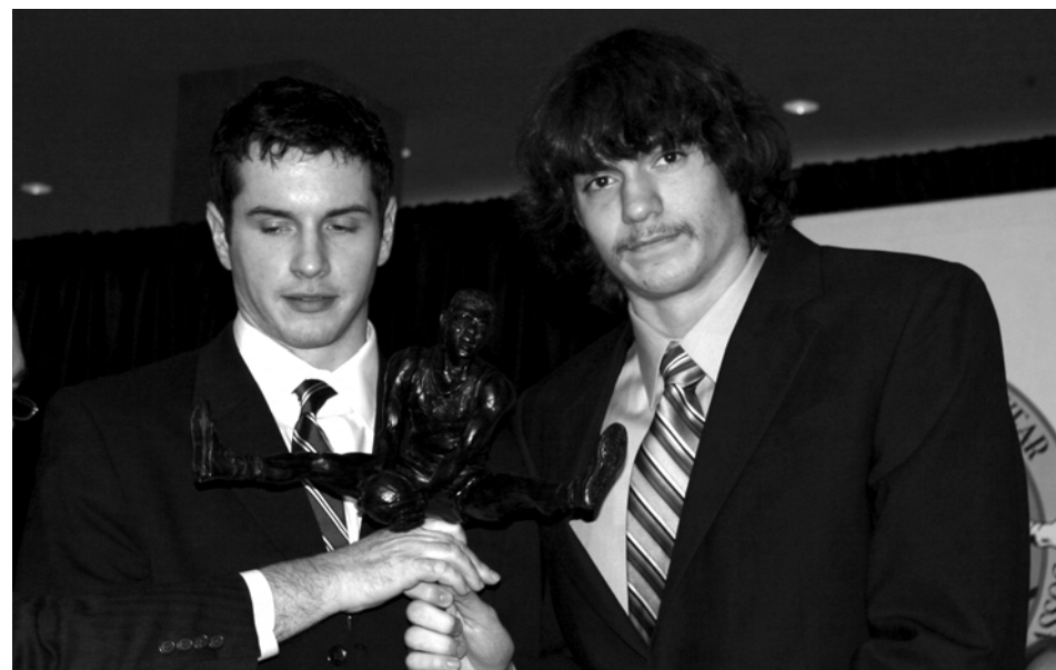
J.J. Redick and Adam Morrison were the USBWA's co-winners of the Oscar Robertson Trophy.