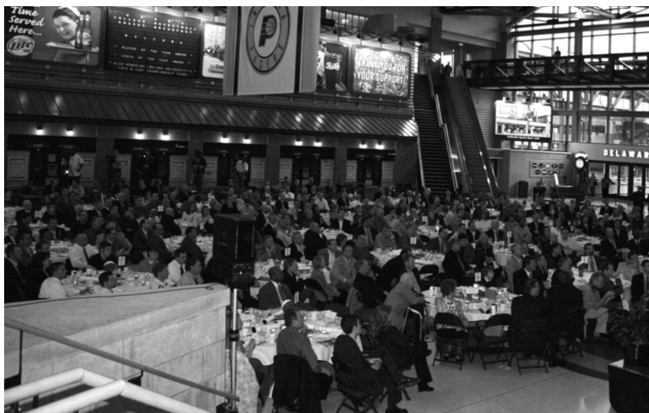
Fans packed into Conesco Fieldhouse for the USBWA's Friday morning breakfast.