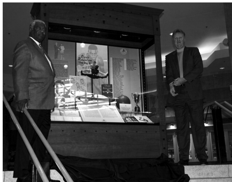
Oscar Robertson and Larry Bird unveil the trophy on permanent display at Conseco.

The USBWA and the NCAA have entered into an agreement to co-sponsor the sports-writing seminar annually both at the men's Final Four and starting next year at the women's Final Four.